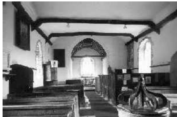
The church seen from the south (left) and the interior looking east (right)

Much of the furniture including the benches, communion rails and pulpit is of the late 16th and 17th century, while the box pews, bell-frame and tower roof are of the 18th century.